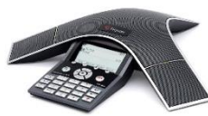
Polycom SoundStation Conference Phones