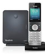
Yealink DECT Cordless